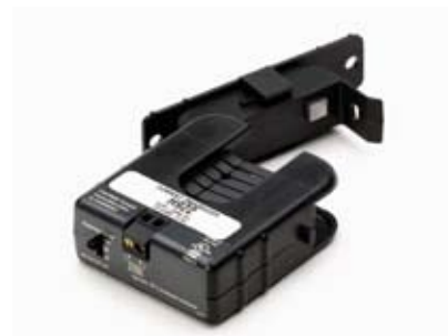
The jaws swing open and a wire can be inserted.