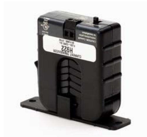
A current transformer with switch selectable 30, 60, or 120 amp settings.

Model Number: CT-30/60/120 Includes 15' of cable